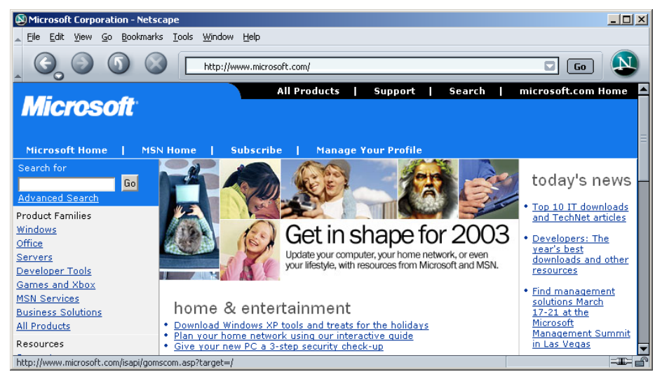
Figure 6–2 Result of http://host/servlet/coreservlets.WrongDestination in Netscape.