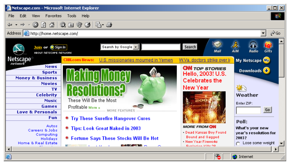
Figure 6–1 Result of http://host/servlet/coreservlets.WrongDestination in Internet Explorer.