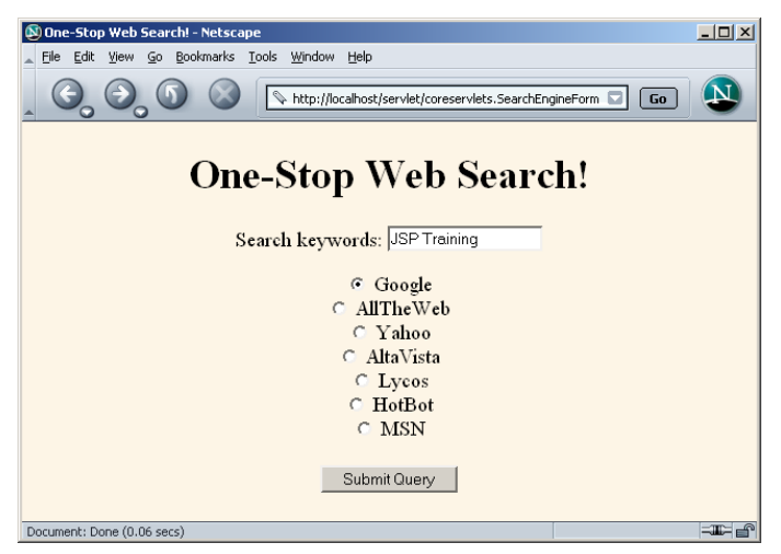
Figure 6–3 Front end to the SearchEngines servlet. See Listing 6.5 for the source code.