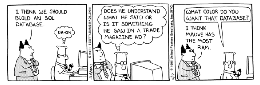
DILBERT reprinted by permission of United Feature Syndicate, Inc.

JDBC provides a standard library for accessing relational databases. By using the JDBC API, you can access a wide variety of SQL databases with exactly the same Java syntax. It is important to note that although the JDBC API standardizes the approach for connecting to databases, the syntax for sending queries and committing transactions, and the data structure representing the result, JDBC does not attempt to standardize the SQL syntax. So, you can use any SQL extensions your database vendor supports. However, since most queries follow standard SQL syntax, using JDBC lets you change database hosts, ports, and even database vendors with minimal changes to your code.